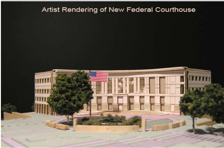
Artist Rendering of New Federal Courthouse

In the spring of 2007 the City Council designated a broad area of Jefferson City's older residential and commercial neighborhoods as "Old Town" in the hope that the designation would spur both interest and investment in the central core. Now there's something new going on in Old Town, an area which can roughly be described as bordered by the Missouri River on the north, Dix Road and Southwest Boulevard on the west, Stadium Boulevard on the south, and Moreau Drive and Clark Avenue on the east. To view a PDF map visit our website at: www.jeffcitymo.org/news/documents/