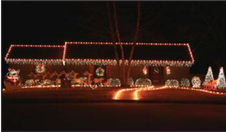
Calls From Santa

Contest rules along with entry forms will be available several times in News Tribune publications or at Parks and Recreation starting in early November.